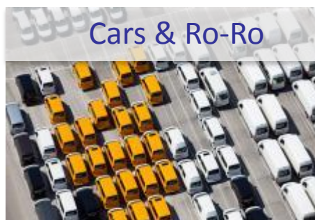
Cars & Ro-Ro