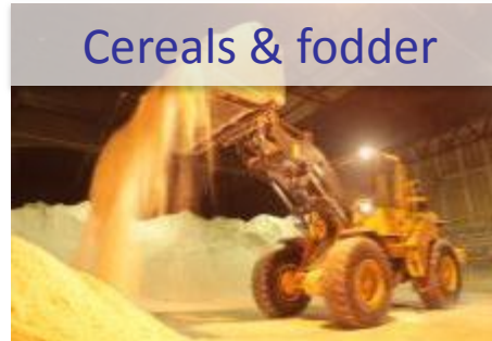
Cereals & fodder