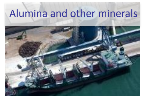
Alumina and other minerals