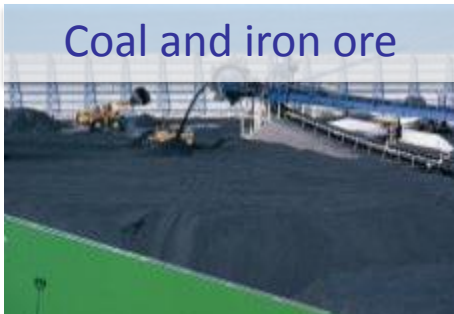
Coal and iron ore